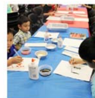
Keep in Touch

The FRIENDS OF THE LIBRARY will soon launch into cyberspace with the development of a new website.